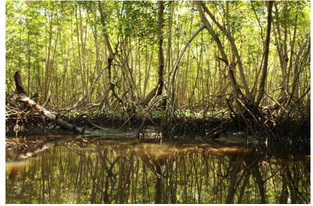
Mangrove Forest in Barra de Santiago - El Salvador