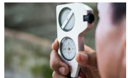
Description of the photographs: Left: Dredging of mangrove Barra de Santiago, El Salvador. Central: Sunrise in Nosara, Guanacaste, Costa Rica. Right: Measuring the height of trees, Costa Rica.